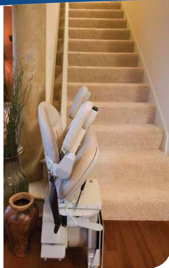
Close installation to wall.