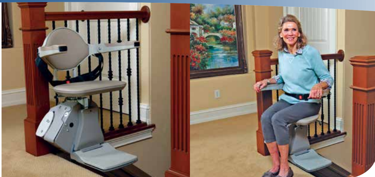
Offset swivel seat makes getting on/off easy.