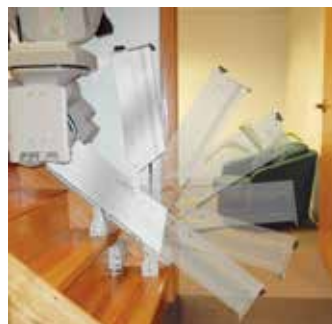
Power or manual folding rails for narrow hallway or when doorway is at the bottom of stairs. Manual operation or push button automatic.