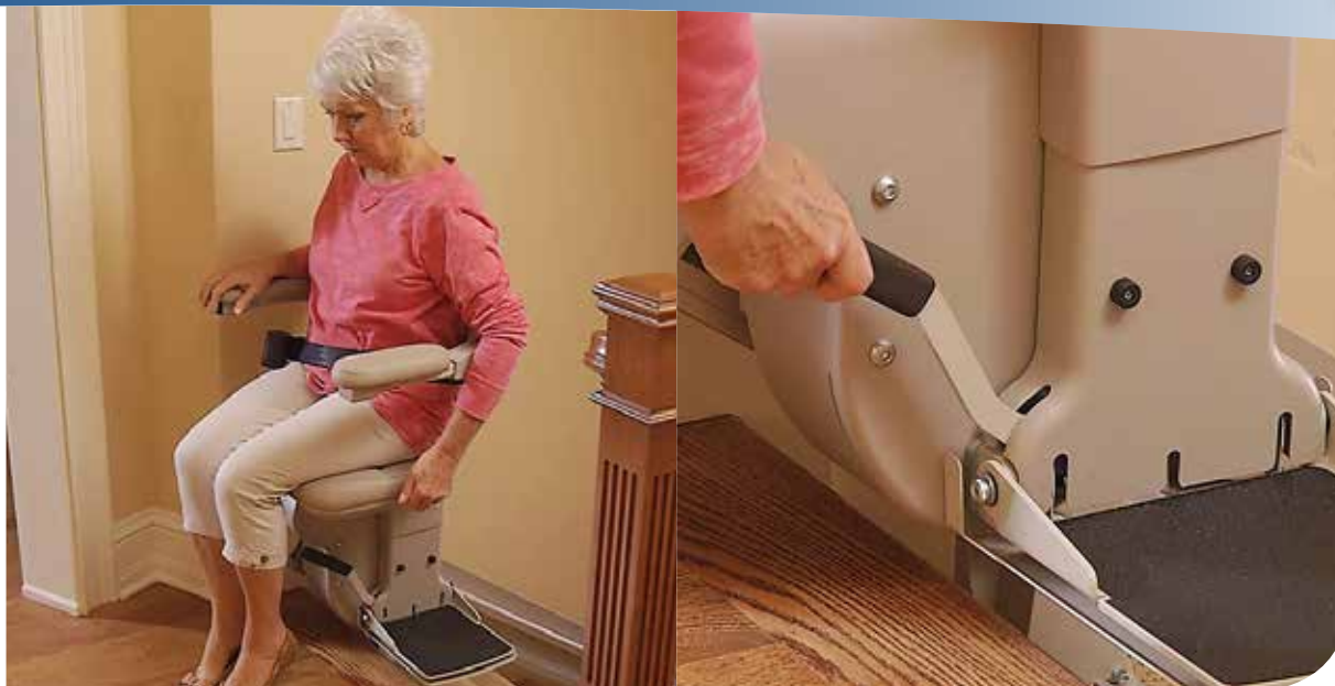
Offset swivel seat makes it easy to get on/off.