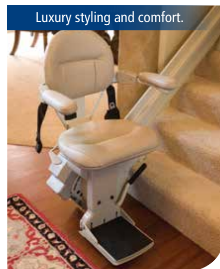
Luxury styling and comfort.