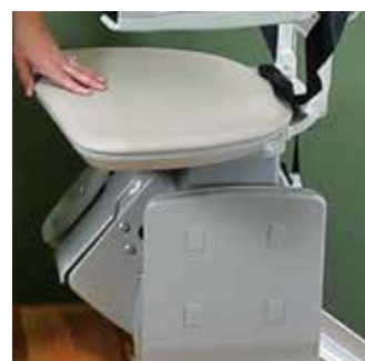
Power swivel seat for effortless exit. Armrest switch control or wireless call/send