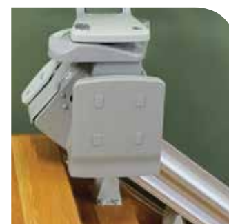
Power folding footrest automatically flips up/down when seat is raised/lowered. Arm switch control optional.