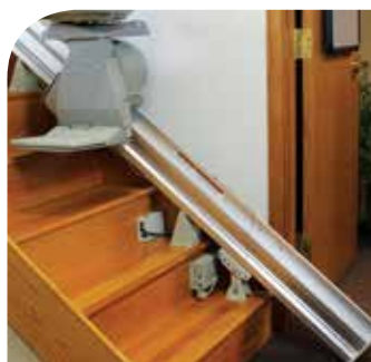
Power or manual folding rail for narrow hallway or when doorway is at the bottom of stairs. Manual operation or push button automatic.