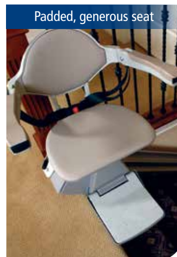
Padded, generous seat