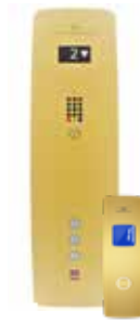
Polished (Mirror) Gold